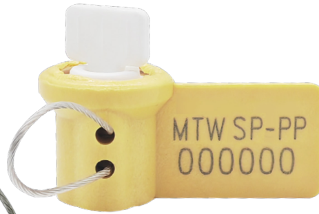
Mega Twister SP - PP (MTW SP - PP)