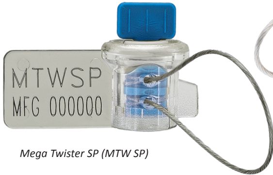
Mega Twister SP (MTW SP)